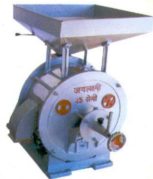
Vertical Ujjain type Flourmills

also available in 25 c.m. to 45 c.m. in Janta Model.