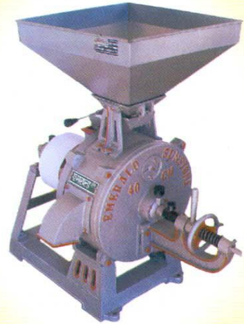
Vertical third Pedestal type Flourmills