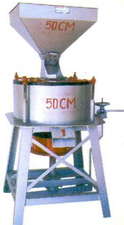
Horizontal Bolt type Flourmills