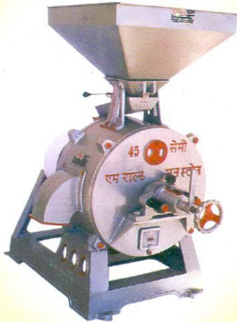
Vertical Rajkot - Sunstone type Flourmills